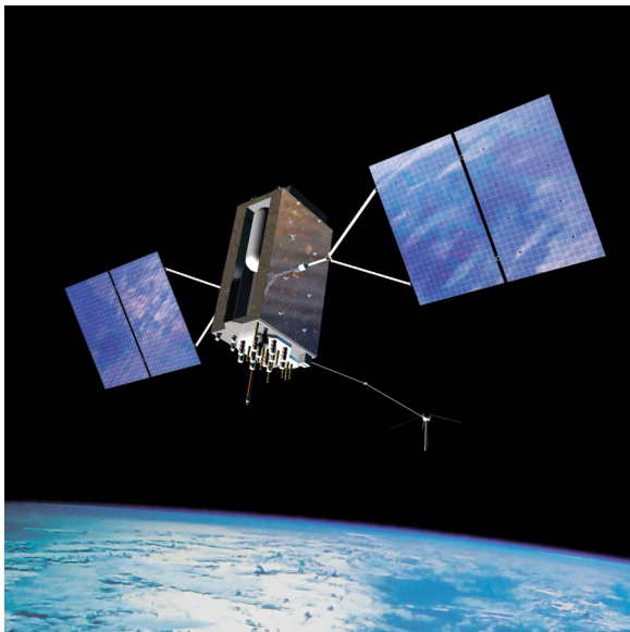
Figure GPS-I-1: A Global Positioning System Satellite

at the same time. A minimum of three signals is required to give the latitude and longitude, while reception of a minimum of four signals is necessary to calculate the altitude. Reception of a larger number of signals produces a more accurate result.