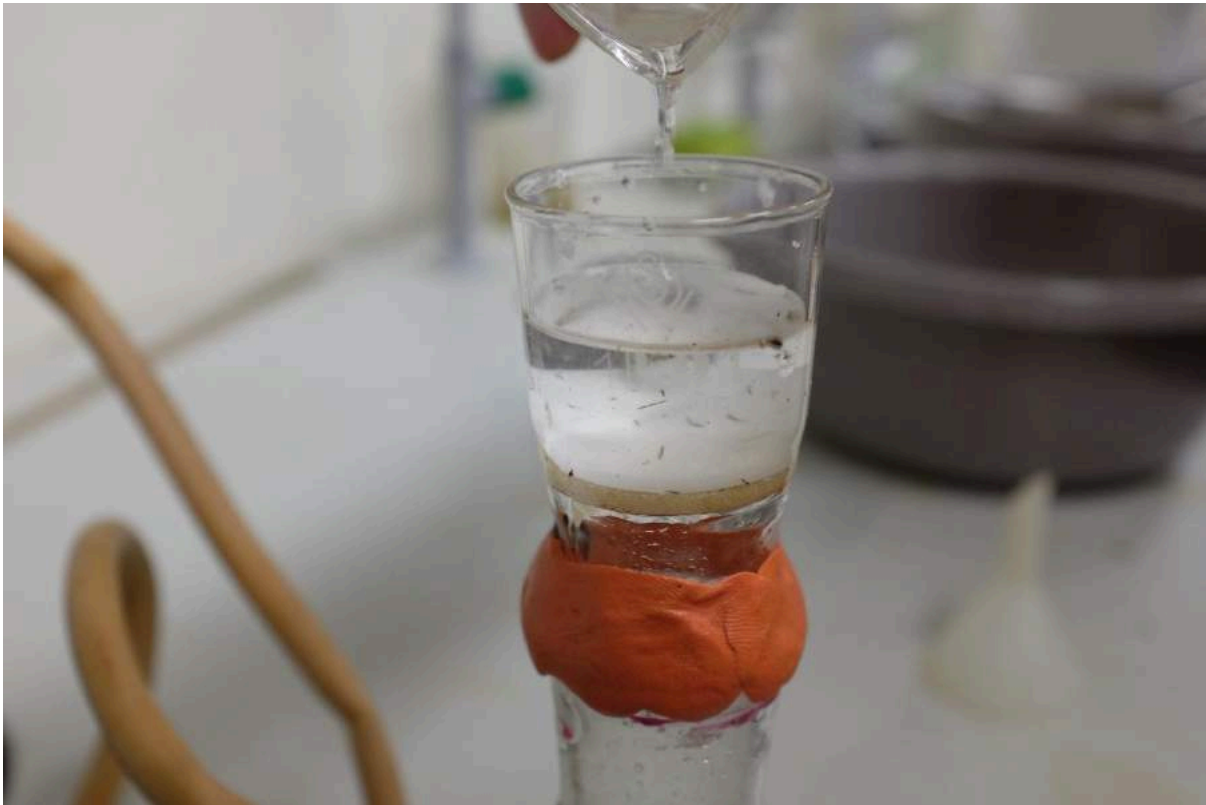
Figure 4. The filtering device.