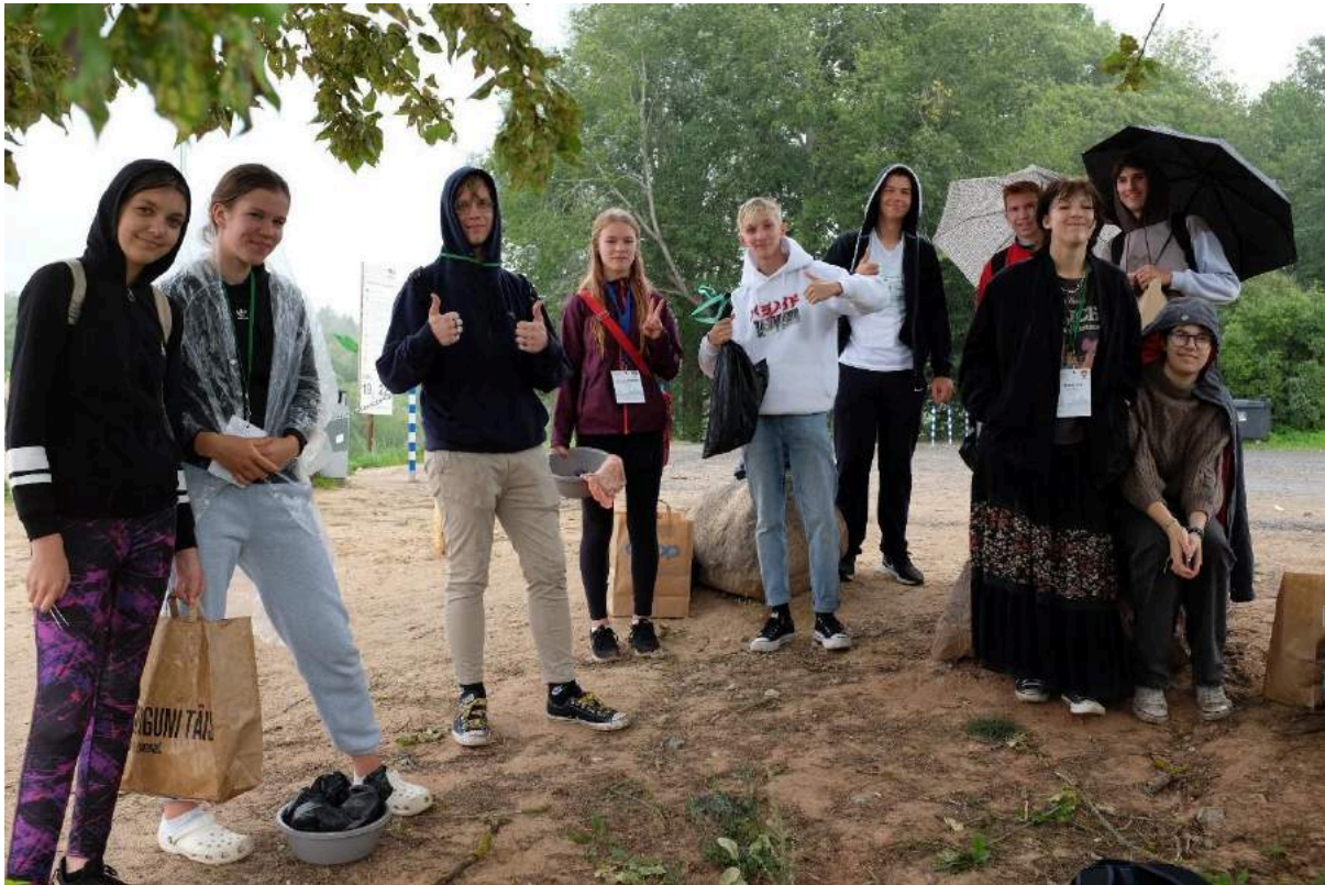
Figure 1. Research team.