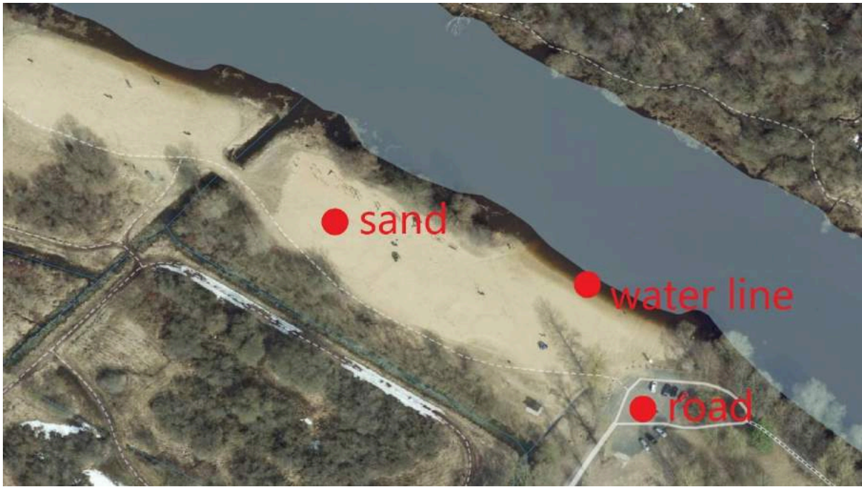
Figure 2. Map of the study area (Estonian Land Board, XGIS 2.0, 2023).