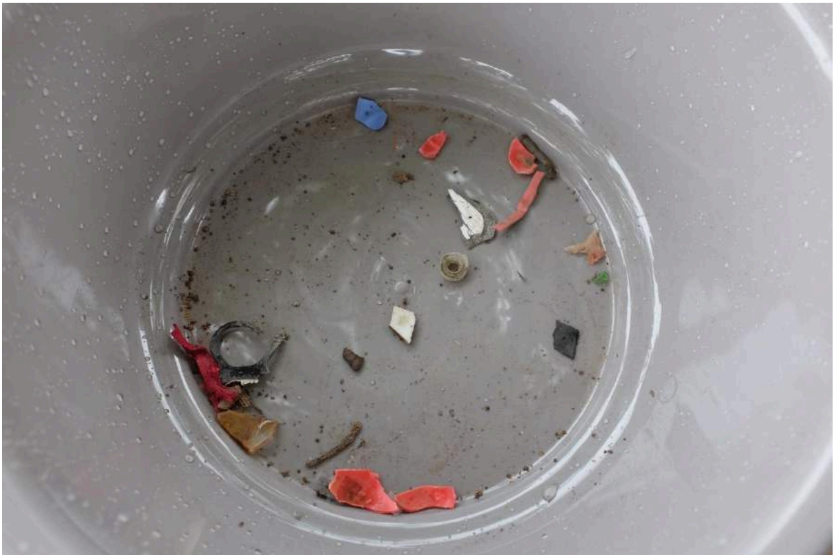
Figure 3. Mesoplastic sampling in River Emajõgi area.