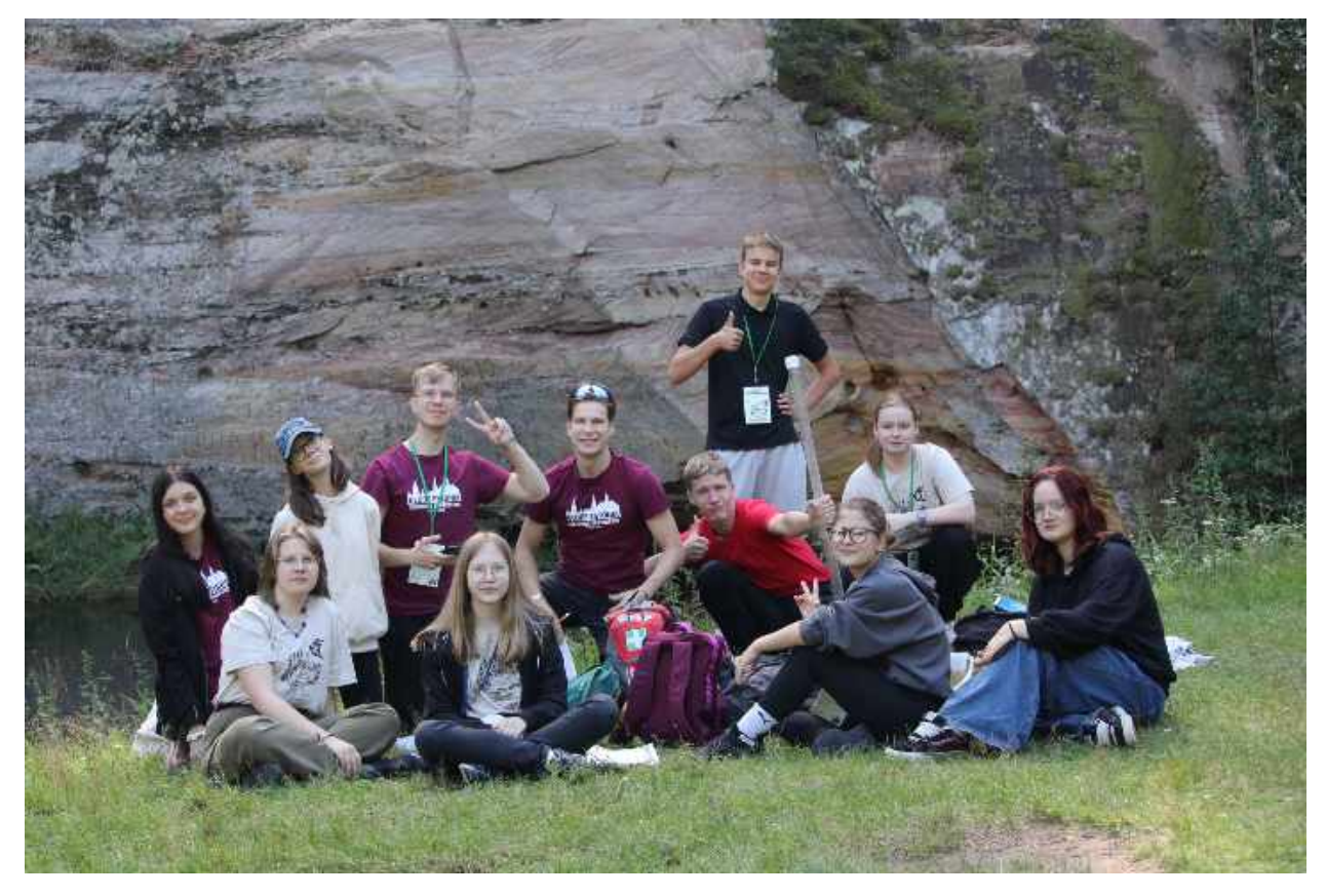
Figure 1. Team River Ahja

Keywords: Ahja river; spring; artificial lake; water quality