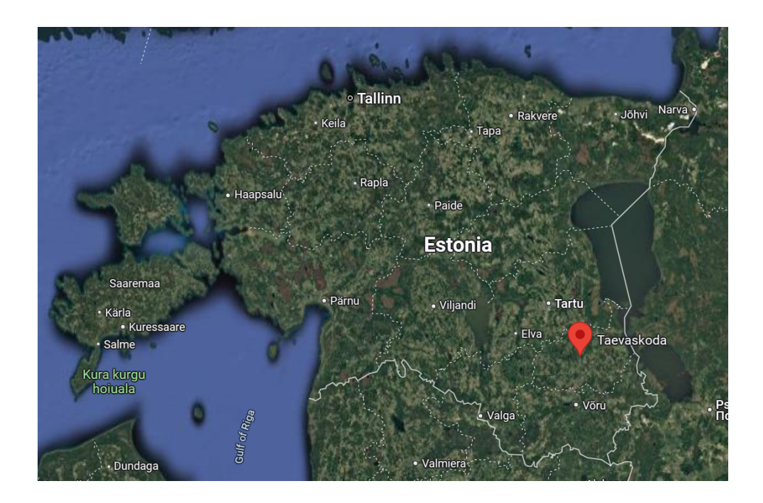
Figure 3. Map of our research location in Estonia (2)