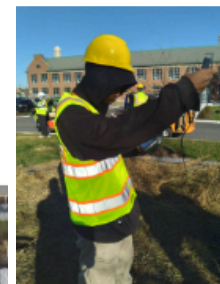
Collecting wind speed