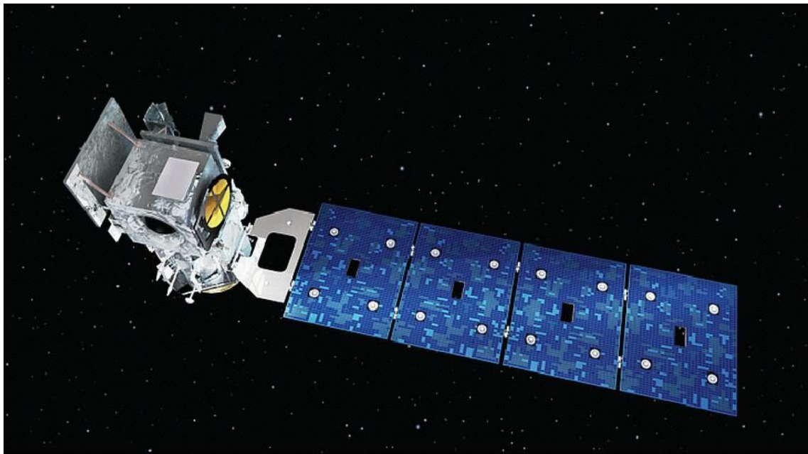
Image 1 - ICESat-2 Satellite