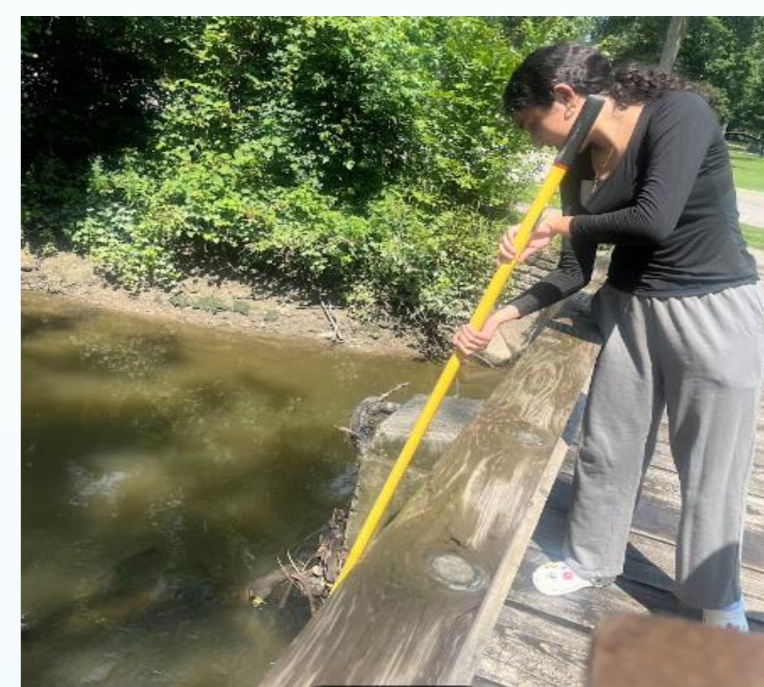
Student researcher collecting water from the Wayside Parr testing location.