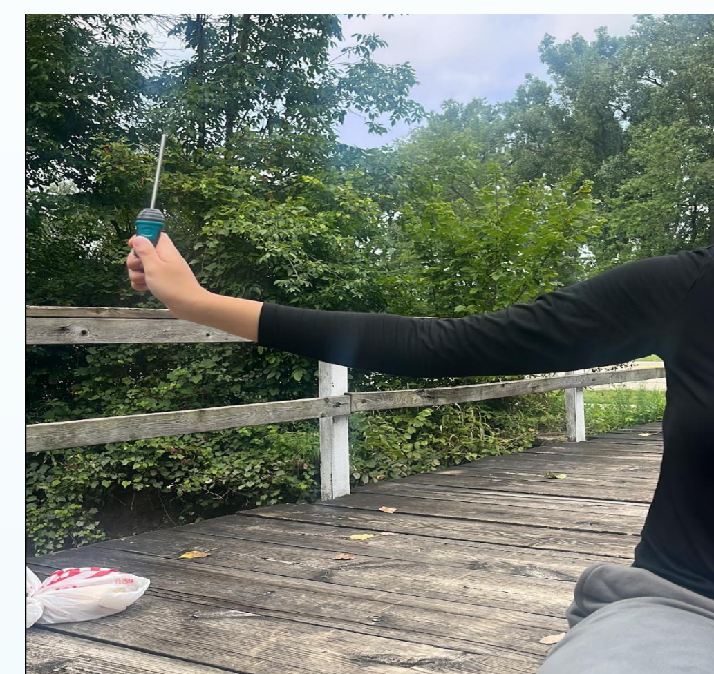
Student researcher collecting one of the atmospheric parameters - Air Temperature.