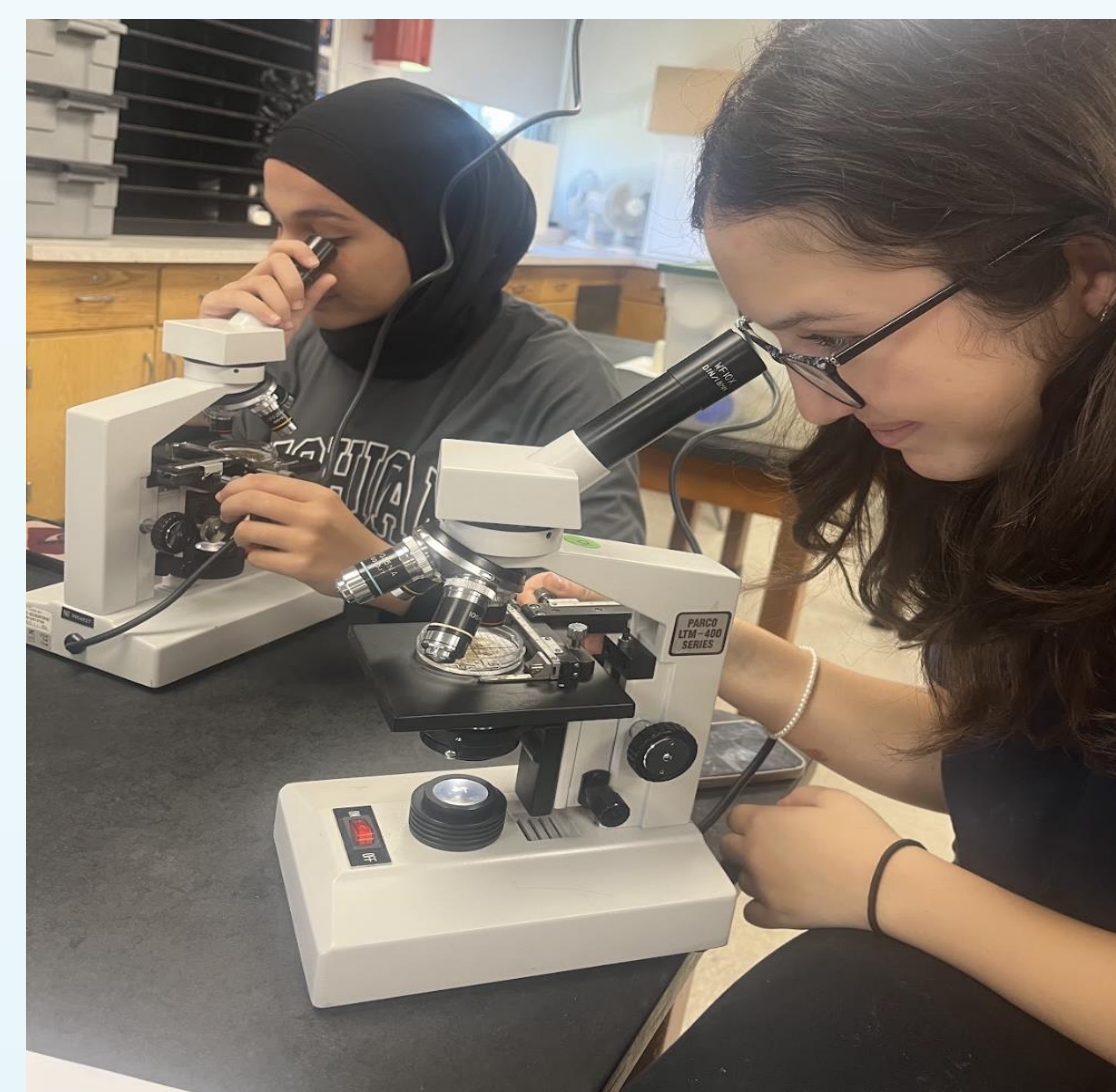
Student researchers analyzing Petri dishes of filtered microplastics.