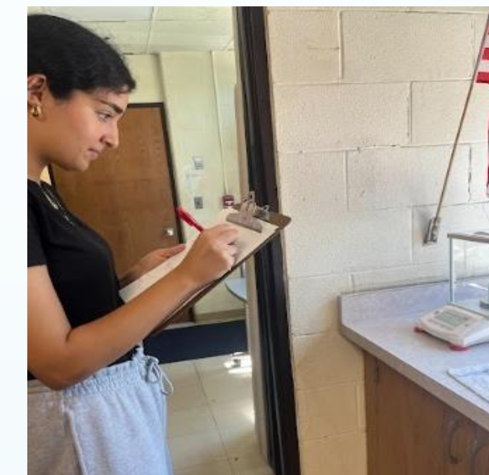
Student researcher collecting data on total solids.