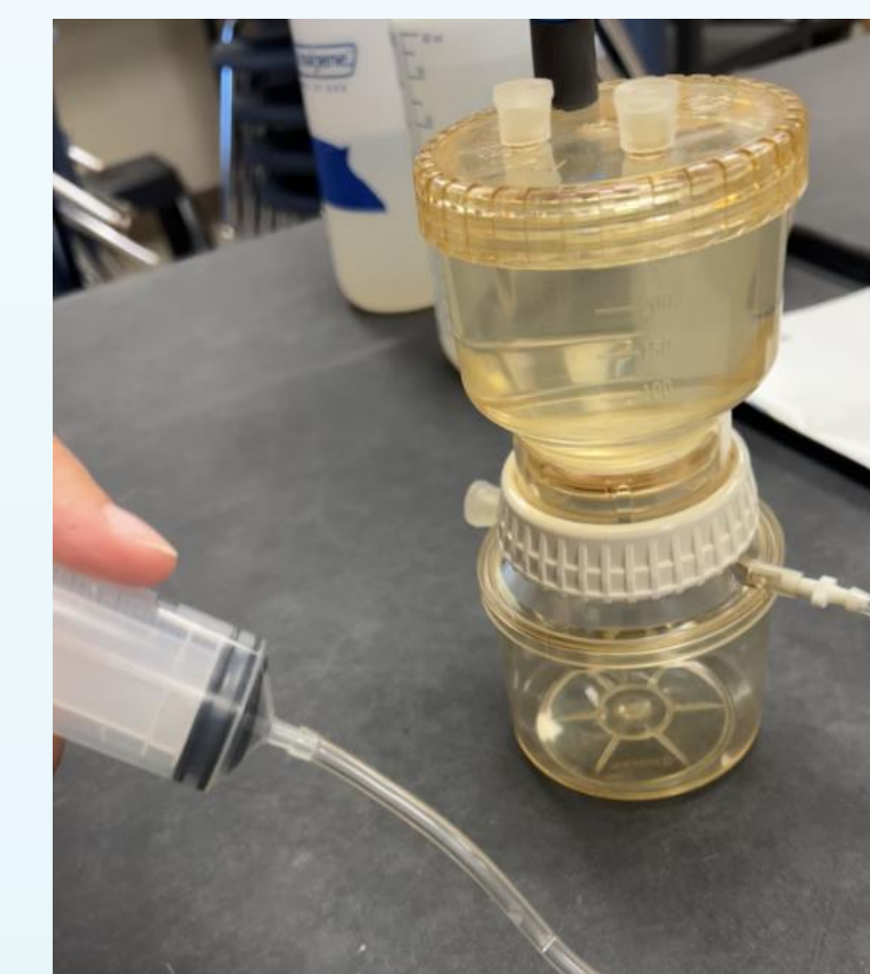
Student researcher using a vacuum filter to draw out microplastic from sampled water