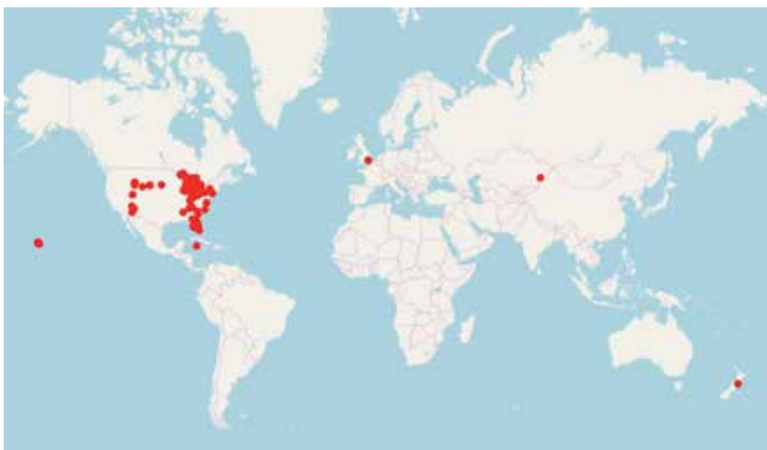
FIGURE 2: Locations of GLOBE cloud measurements were submitted by Shumate Middle School students.

All challenge members take cloud measurements in their local neighborhoods and while traveling with their families. Some students take measurements out of state and even out of country (Figure 2). Once again, this is another example of how technology can be used to engage students.