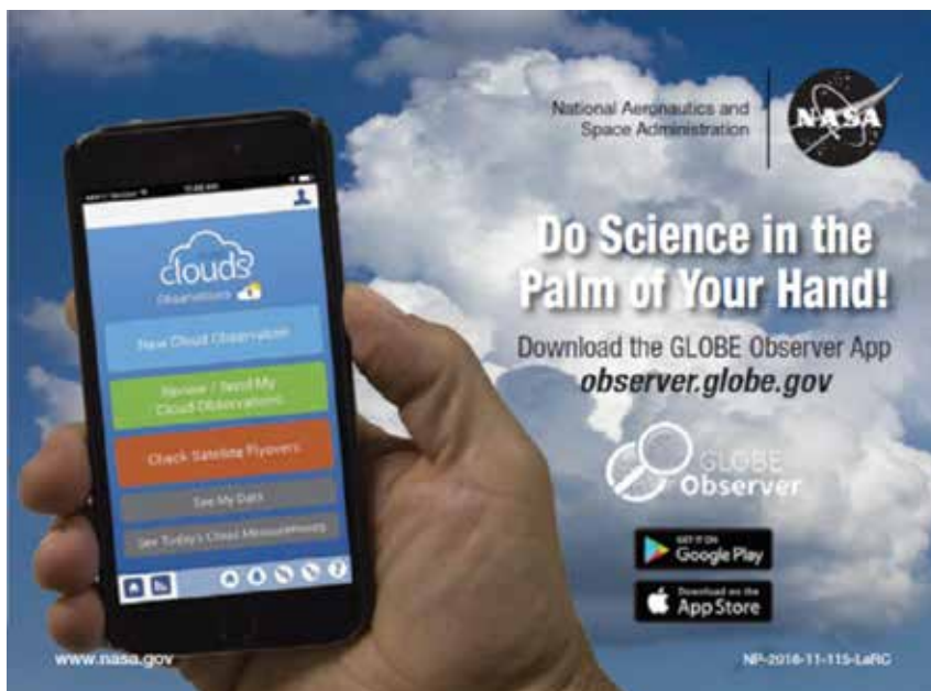
FIGURE 1: Cloud reporting portion of the GLOBE Observer mobile app.

The GO app runs on any mobile device and is free at the Apple app store and Google Play. Note: current editions of the app do not work on Chrome books. An account is needed with an email address to record data within the GO app.