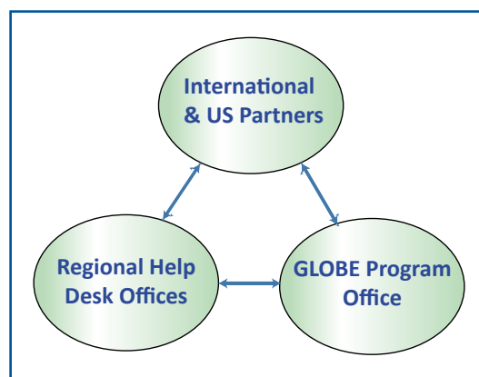
Fig. 1: The GLOBE Program Organizational Structure

The GLOBE Community includes all of the above, together with all GLOBE Schools, Teachers, Students, Scientists and supporters world-wide. This document focuses on the GLOBE Program as defined above, not on this wider GLOBE Community.