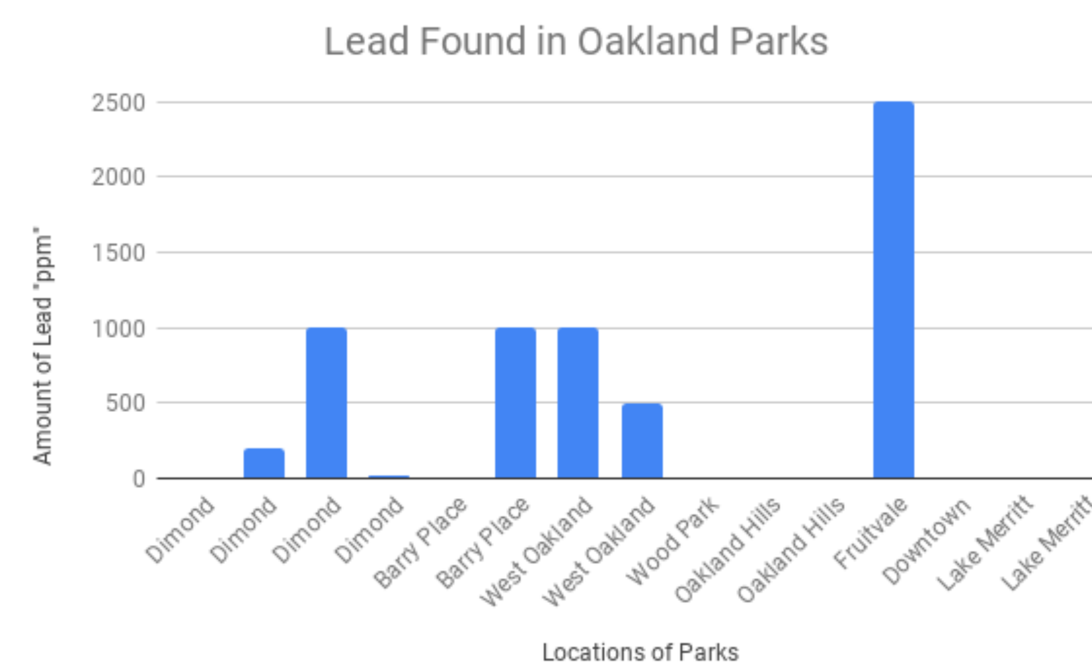
Graph of our Results