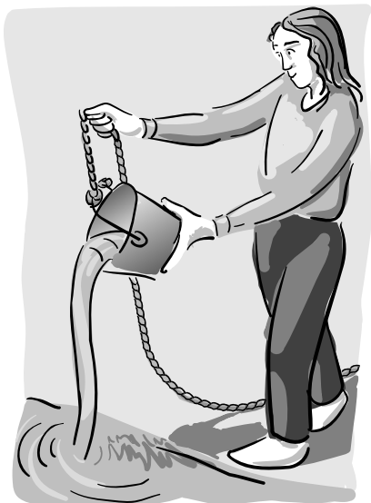
Rinsing the water bucket.