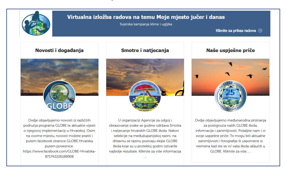
Fig. 1 Croatian GLOBE web site home page with highlighted title leading to virtual exhibition, the part of Climate and carbon world campaign.

Faculty of Sciences and OIKON institute for applied ecology provided a presents for schools and meeting facilities in Zagreb. US Embassy covered traveling costs for teachers and students, because the schools were from four different parts of Croatia.