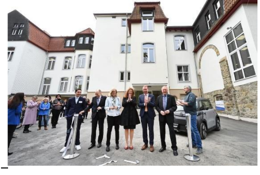
Climate Conference at the Congress Hall in Bad Lippspringe, September 2023