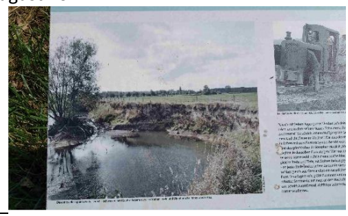
The rewilding and the ring around the Lippe river and the new way of the "Lippe" outside the lake in June 2024