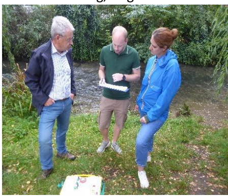
Teacher Training, August 2023

The group visited the areas of interest and researched historical and economic aspects, as well as actual development pans...historical aspects of water problems and new developments of nature restoration and land recultivation. The group will deepen their experience during the upcoming years, in order to offer a new project on tributary rivers in other areas in Europe.