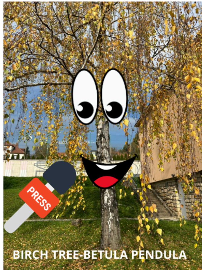
BIRCH TREE-BETULA PENDULA

And we tried which colour suits me the best!