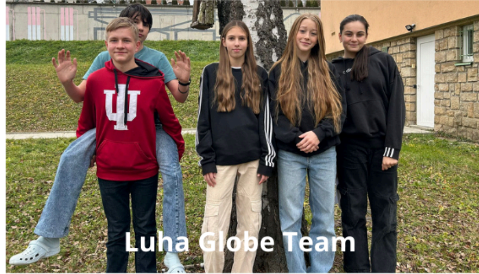
Luha Globe Team

It was great! I've spent the year with my best friends from Luha Globe team!