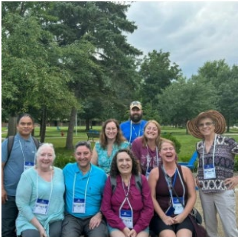
New International Group for Research on Hydrosphere and Macroinvertebrates in Freshwater Courses. Collaborative Project Across 4 Continents.