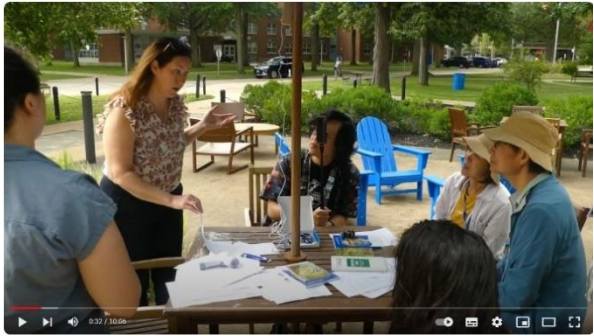
Left: Presentation of the 2nd Year of the “Trees within LAC” Campaign at the GLOBE Annual Meeting 2024. Members of the Campaign Committee and Director of the Regional Office. Right: Presentation of Learning Activity: Wildlife Monitoring with GLOBE Atmospheric Parameters.