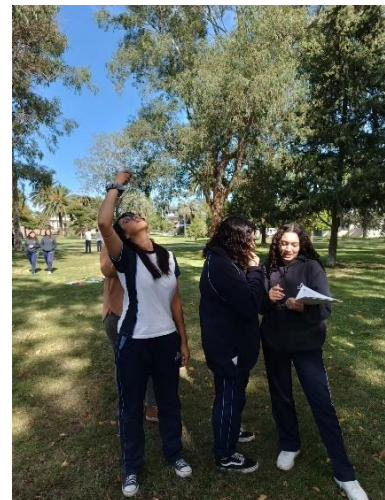
8th Network of Environmental Education Meeting and 3rd Latin American Round (June 7-9, 2024)