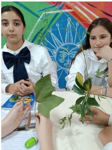
Visits to educational centers to promote GLOBE activities and measurements using the app.