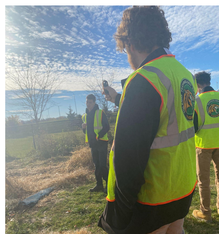
Collecting wind speed data