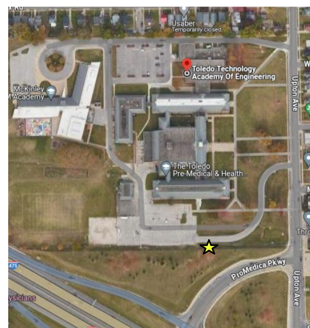
Toledo Technology Academy our research site

★ TTA: The location our research was conducted